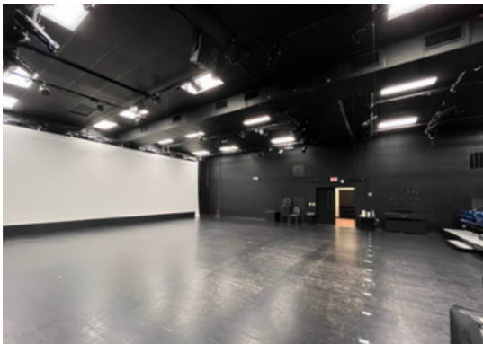
Black Box Performance Space

The North Carolina Theatre Conservatory & Engagement provides robust arts programming that includes year-round theatre classes for youth ages 3 to adult. The Conservatory offers vigorous training from the entry-level Education Department to Pre-Professional training.