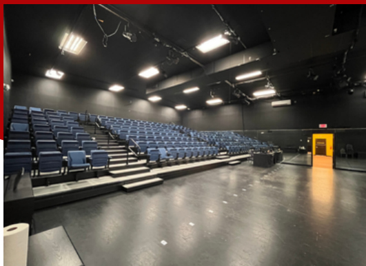
Black Box Performance Space

North Carolina Theatre Conservatory has space available for rent that includes a Black Box Performance Space, Dance Studio, Voice Studio, and Acting/Self-Tape Studio.